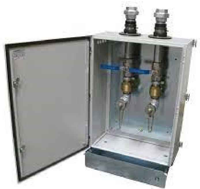
Fuel Filling Wall Mounted, Spill Container