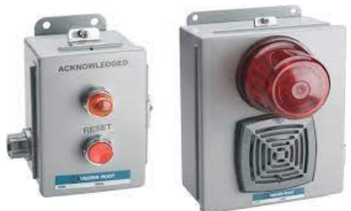
Overfill Alarm Unit