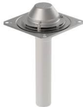
Siphonic Roof Drainage