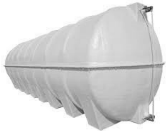
GRP Diesel Tank