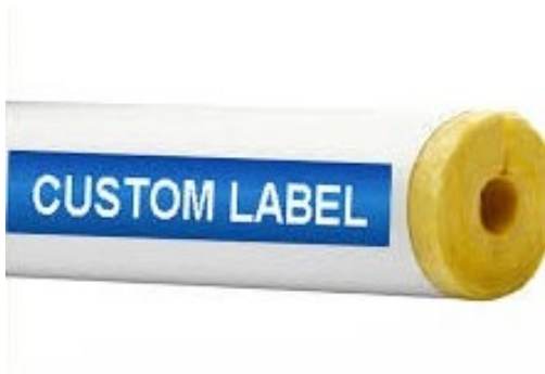
Pipe, Duct Labels Valve Tags, Name Plates