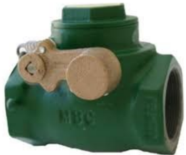
Valves All Types