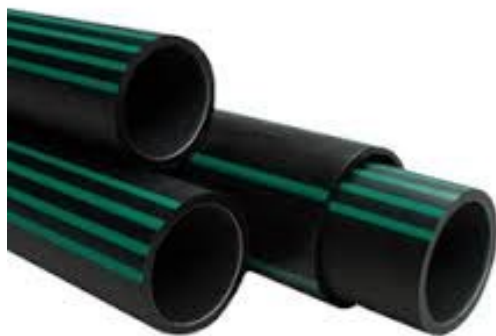
Pipes Single Wall, Double Wall