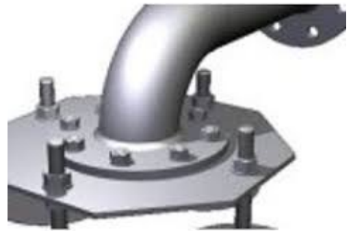
Anti - Vortex Plates