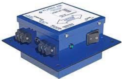
Air Ionization Filters